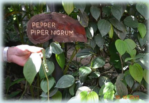
Spice Garden Matale